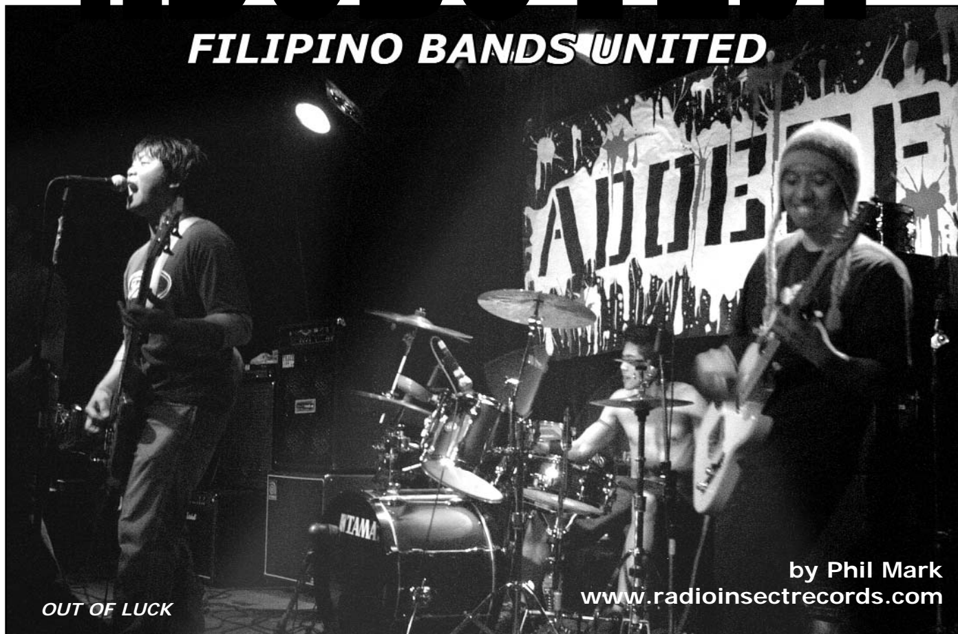
OUT OF LUCK